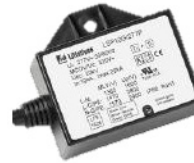
Surge Protector 20kV, 10kA HL-LSP10GI277P