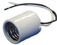
Mogul Socket LH-MOE-01