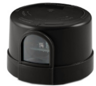
Twist lock long life photocontrol Multi-volt, fail-on, 8A at 120V and 5A at 277V HI-LL-127-15-BK-12