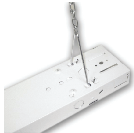
FSC detail shown with Hanging Chain and V-clip mounting detail; HI Part HF-2CV (sold separately)