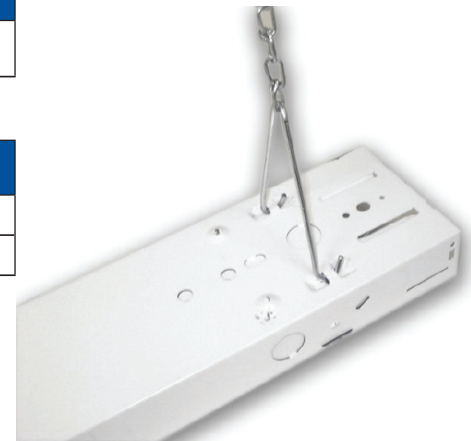
FSC detail shown with Hanging Chain and V-clip mounting detail; HI Part HF-2CV (sold separately)