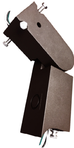
XAL-SF: Slip Fitter

Accessories (Sold separately, fixture comes with straight mounting arm for square poles)