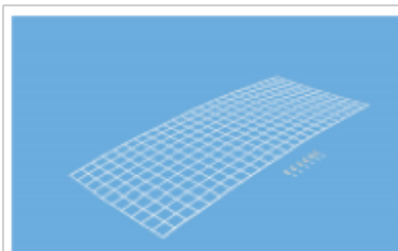
HFA1-WG Wire Guard