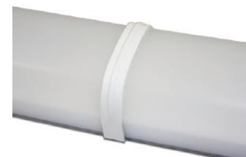
Snap-on coupler available for easy continuous row mounting