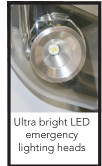
Ultra bright LED emergency lighting heads