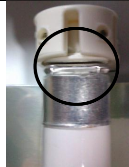
Diagram 2-T5 lamp seating

The dimple on the lamp base is aligned with the slot in the lamp holder.