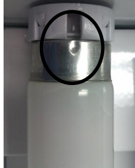
Diagram 1-T8 lamp seating

⚠ WARNING: Improper seating of lamps can create a fire hazard. Whether field or factory installed, ensure lamp position is correct before energizing fixture. See Diagrams 1 and 2.