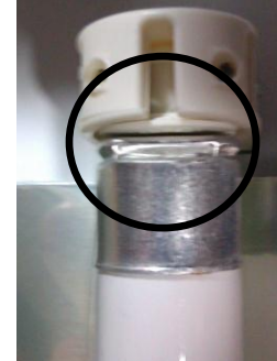
Diagram 2-T5 lamp seating

The dimple on the lamp base is aligned with the slot in the lamp holder.